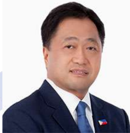
HON. CESAR V. PURISIMA

Cesar V. Purisima is the Secretary of the Department of Finance, appointed by President Benigno s. Aquino on June 30, 2010. He is also chair of the Economic Development cluster of President Aquino's cabinet.