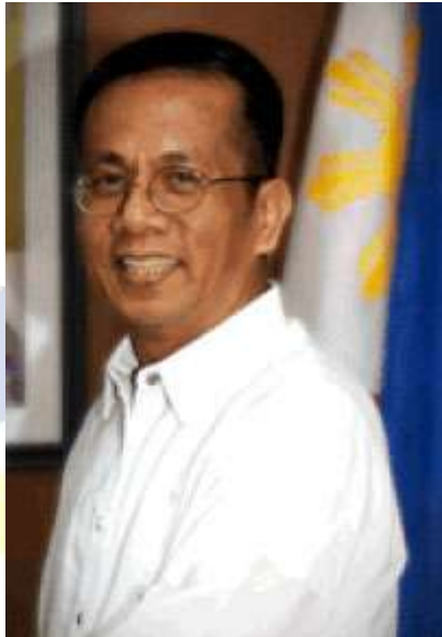
Hon. ARSENIO M. BALISACAN

Dr. Arsenio M. Balisacan is Socioeconomic Planning Secretary and Director- General of the National Economic and Development Authority (NEDA). Prior to his appointment in NEDA, he was Dean and Professor of the University of the Philippines (UP) School of Economics and Executive Director of the Philippine Center for Economic Development. He has taught Development Economics, Agricultural and Resource Economics, and Economics of Poverty and Inequality.