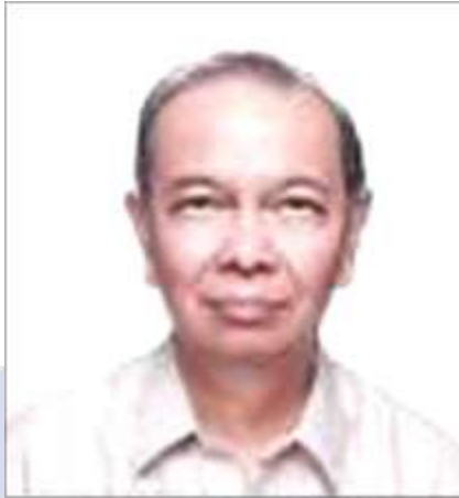
HON. FLORANTE A. CASTILLO